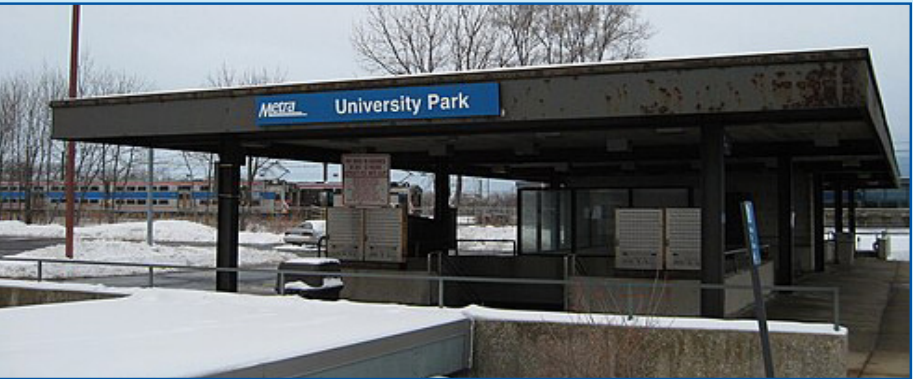
The VanGo van is parked at the University Park Metra Station, 1900 University Park IL, 60466