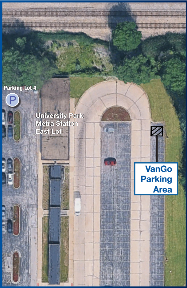
Pick-Up Point: University Park Metra