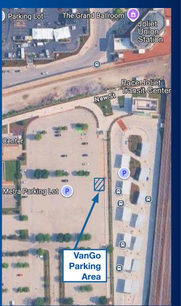
Pick-Up Point: Joliet Gateway Center