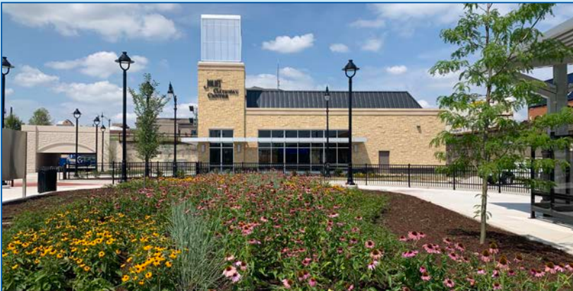
The VanGo van is parked at the Joliet Gateway Center at 12 New Street, Joliet IL.