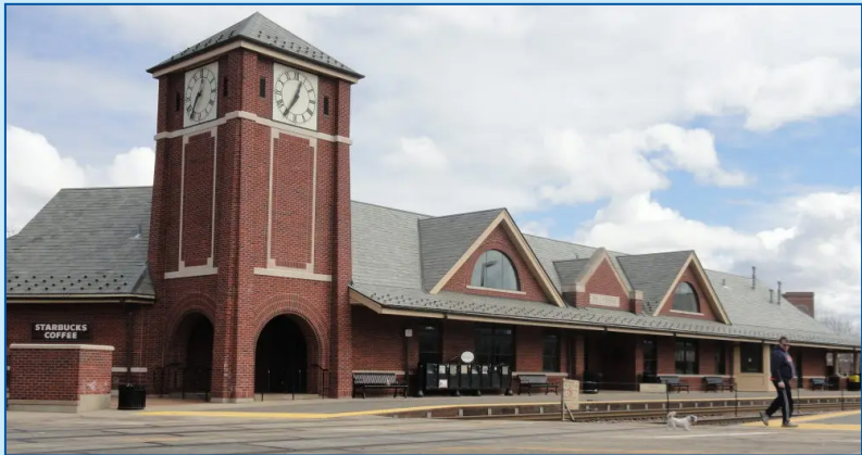
The VanGo van is parked at the Palatine Metra station at 137 W. Wood St.