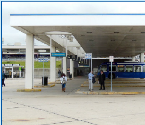
The VanGo van is parked at the Itasca Metra station at 309 W. Irving Park Rd., and the Rosemont CTA station 5801 N. River Rd.