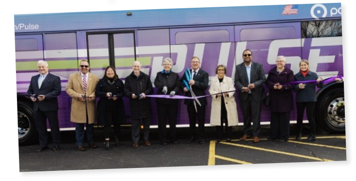
State, county, and local officials join Pace to commemorate launch of daily service on the second Pulse line on November 10, 2023.

The Pulse network is expanding! On October 29, Pace celebrated the launch of the Pulse Dempster Line, the newest addition to its arterial bus rapid transit network. The new service offers a fast, frequent, and reliable way to get to destinations from Evanston to O'Hare Airport. Dempster is the second Pulse Line to launch and connects to the CTA Purple and Yellow Lines; Metra Union Pacific North, Union Pacific Northwest, and North Central Service lines; and Pace's Pulse Milwaukee Line. Leveraging Transit Signal Priority (TSP) technology, which extends green lights for buses at intersections, Pulse efficiently navigates through traffic with up to 15 minutes in reduced travel times.