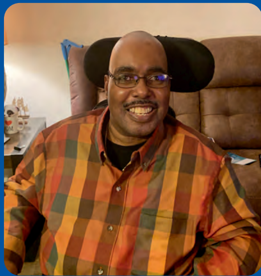
Message from the Chicago ADA Advisory Committee Chairman:

Please do your part as a rider and continue to be safe by choosing to wear a mask when riding public transportation.