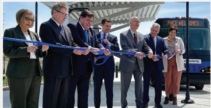
Ribbon cutting at the Joliet Center

On Wednesday, May 4, 2022, we had the honor of hosting U.S. Secretary of Transportation Pete Buttigieg, Governor JB Pritzker, and Congressman Bill Foster at the new Joliet Transit Center where we were able to showcase the good things that happen when leaders fund essential transportation projects. This is the first time in Pace's history that we have had the U.S. Secretary of Transportation, the Governor and a Congressman at one of our facilities!