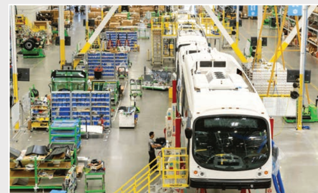
Proterra buses being built in California.

After our Board's approval in March, Pace officially ordered 20 Proterra ZX5 Max electric transit buses. This $26 million order was purchased off the State of Georgia's existing contract with manufacturer Proterra. Our ability to tag onto that existing contract allowed Pace to expedite the procurement process, putting us ahead of our own schedule. We expect to have the first vehicles in operation by 2023.