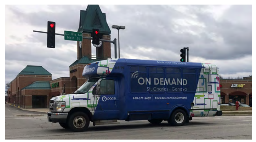
Above - Pace St. Charles - Geneva On Demand service. Right - The Pace On Demand mobile application interface.

Through survey efforts and other external outreach, Pace is gauging customer feelings about personal safety and COVID-19 while aboard transit vehicles. This information may help assess when and how New Mobility options should be implemented. Pace's RideShare application, along with other emerging technology and marketing programs, may attract customers back to using smaller vehicles, particularly if such feature convenient access to rail stations and other fast long distance transit options like Pace Express.