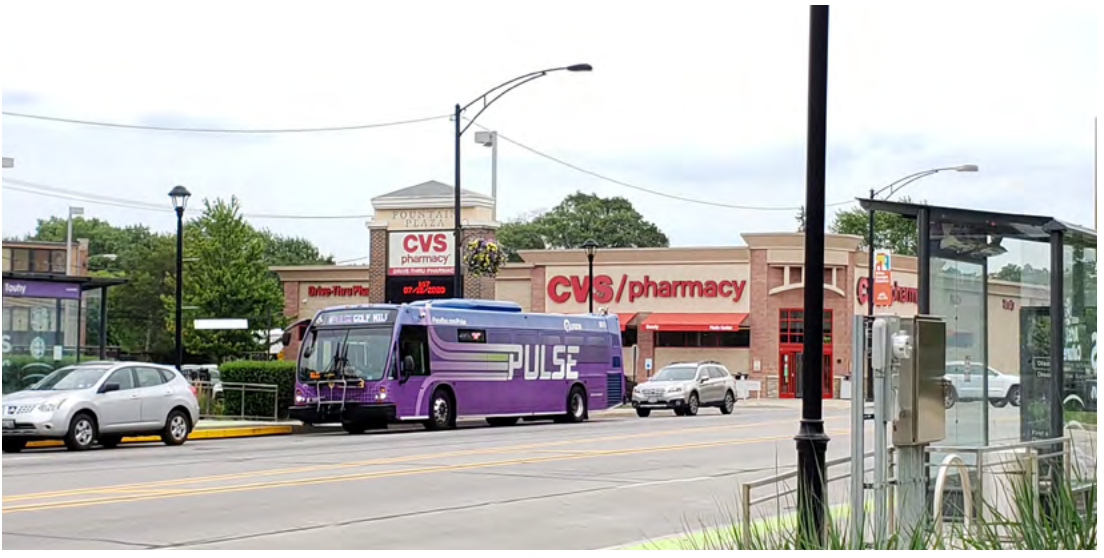
The Milwaukee Line operates along a corridor where high passenger activity has been observed for many years prior to the launch of the new service and showcases an environment suitable for Pulse treatments.