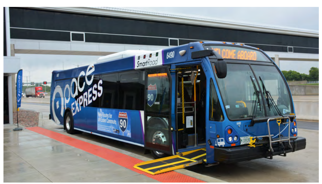
Pace I-90 Barrington Road Station in Hoffman Estates, Illinois.

Pace operates Bus on Shoulder service along the I-94 Edens Expressway. Service in this corridor was in operation prior to IDOT constructing outside shoulder riding capabilities for Pace buses, which has benefited from improvements to on-time performance and reliability. However, initial market assessments conducted in the 2016-2017 North Shore Transit Coordination Study and other staff-led efforts have noted additional demand for service along this highly-congested roadway that connects the Loop and Northwest Side of Chicago with North Shore communities and the employment-rich Lake Cook Road corridor. Driving Innovation calls for further study of these markets in the upcoming Network Revitalization initiative and future Rapid Transit Program efforts.