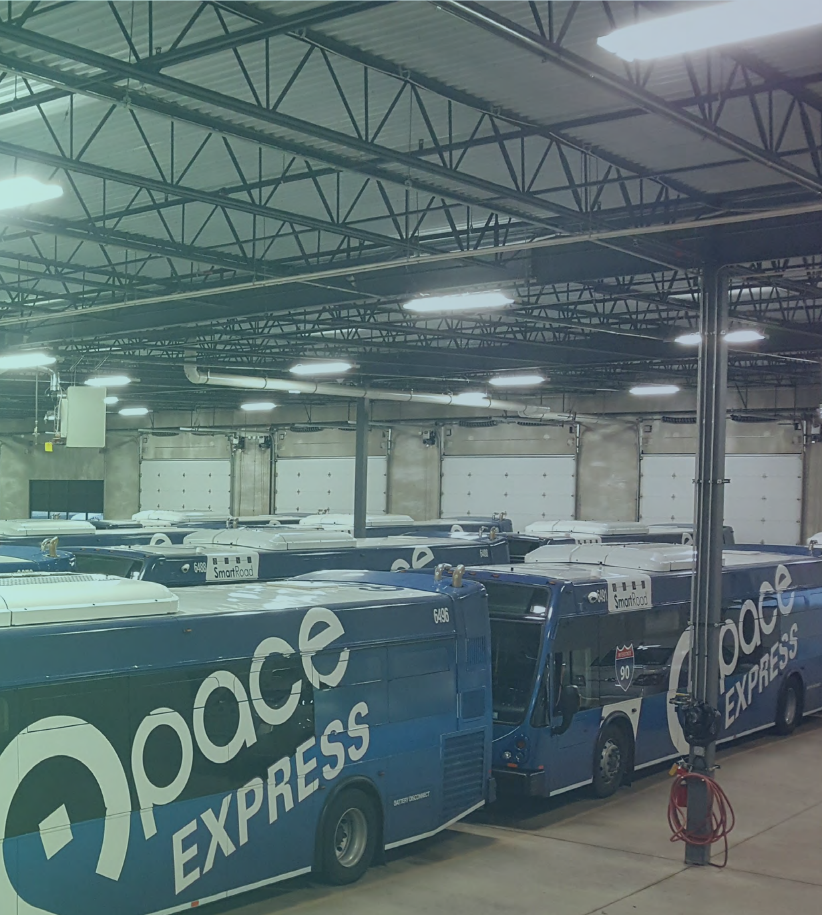
Buses staged at Pace's East Dundee garage facility, managed by Pace River Division. Pace's existing River Division garage will be expanded to allow more space for services operating along I-90 and locally in Elgin and the surrounding area.