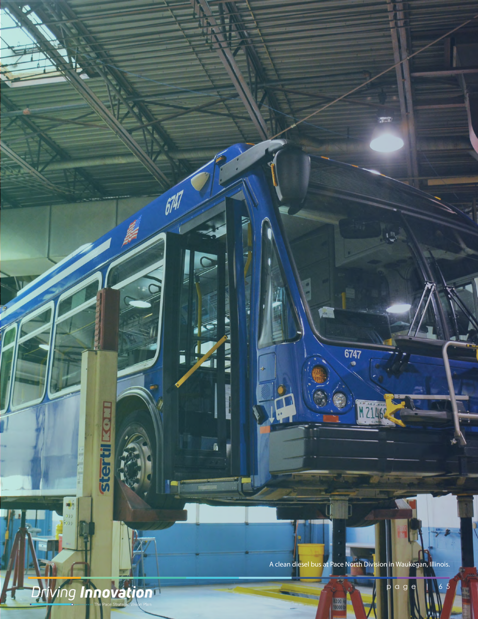
A clean diesel bus at Pace North Division in Waukegan, Illinois.