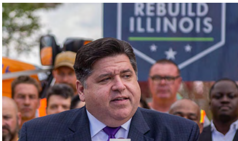
Illinois Governor JB Pritzker speaking about the $45 billion Rebuild Illinois capital plan (Illinois Business Journal, 2020)