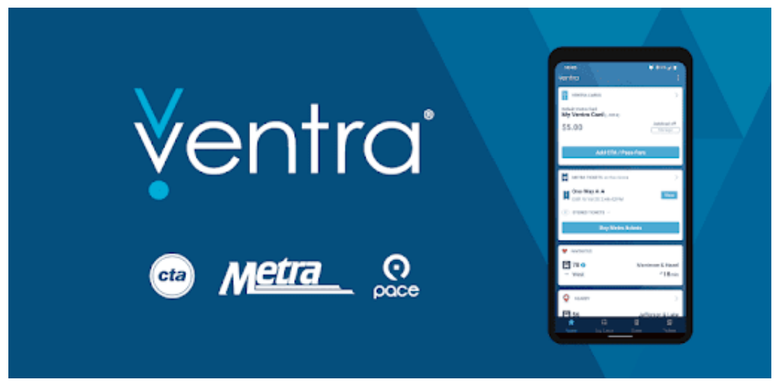
The new Ventra mobile application

Pace will continue to innovate new ways of providing flexible, fast, and convenient trip planning and fare payment options to both improve customer ease of use and speed up boarding and alighting processes.