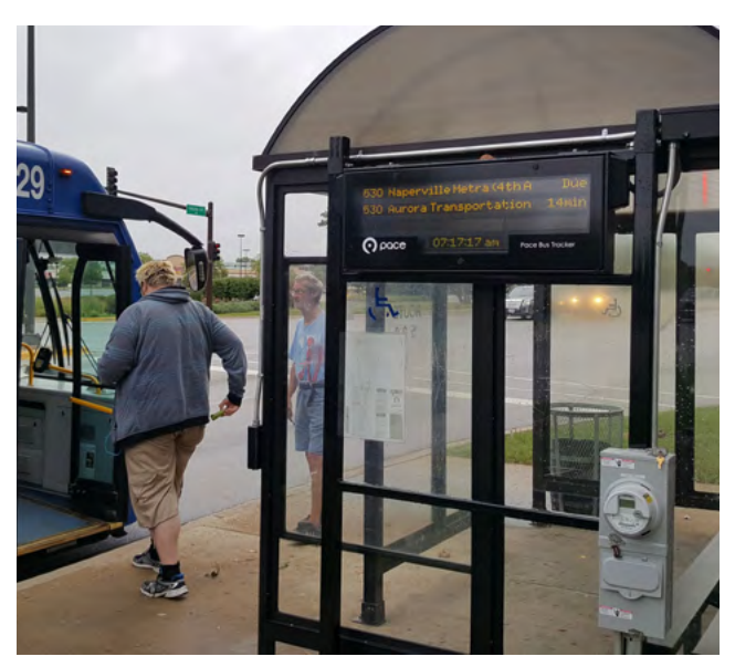
Real-time next bus digital information is displayed at a Pace bus stop in Naperville, Illinois.

Digital real-time information screens are a relatively simple yet effective passenger convenience that helps reduce the need to use paper bus schedules and mobile phone applications to check bus arrival and departure times. Pace will continue to deploy real-time information signs at key locations throughout the service area.