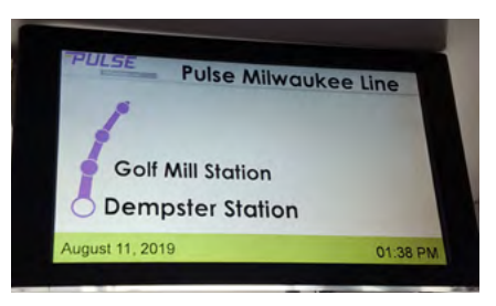
On-board digital information displays depict current and upcoming Pulse stations while in transit on Pace's Pulse Milwaukee Line.