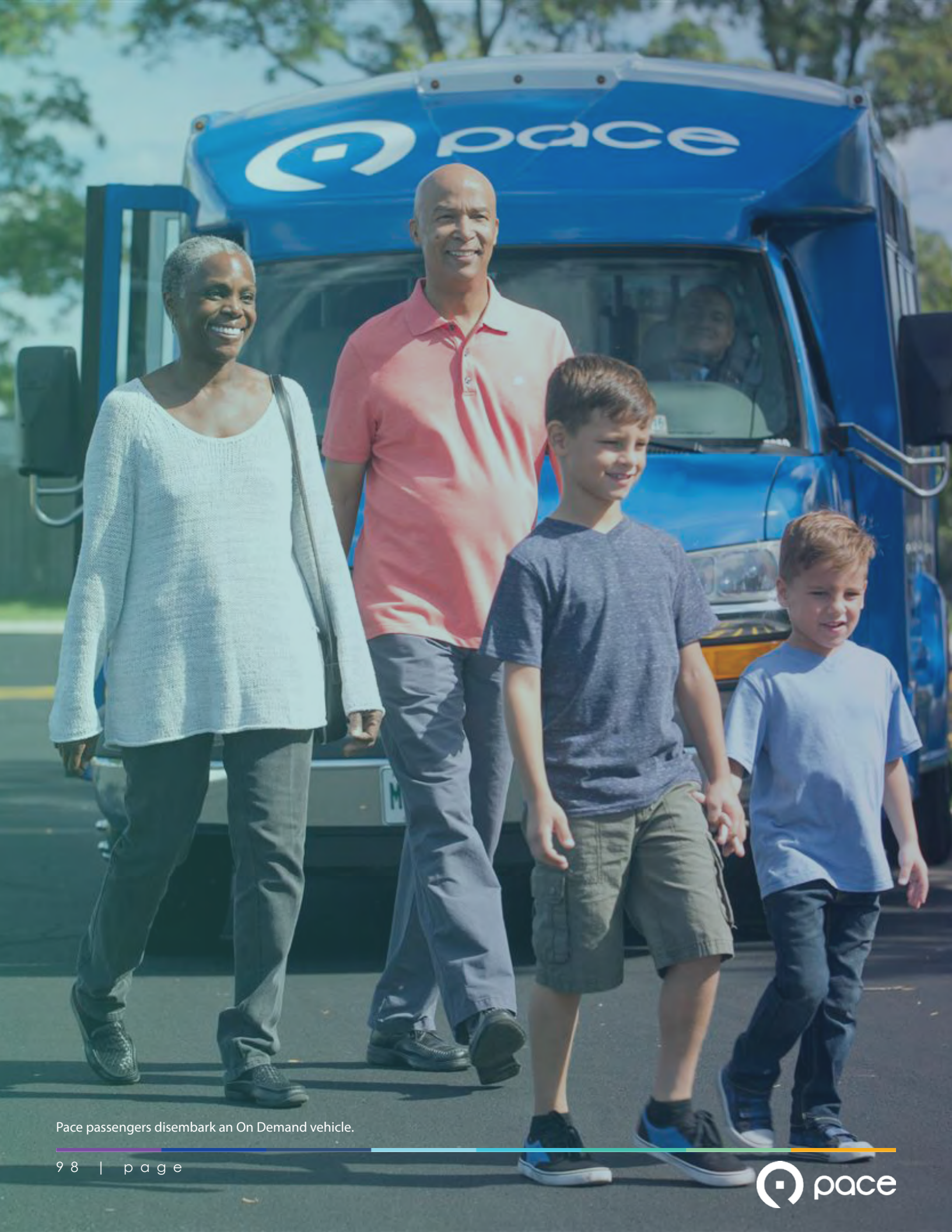
Pace passengers disembark an On Demand vehicle.