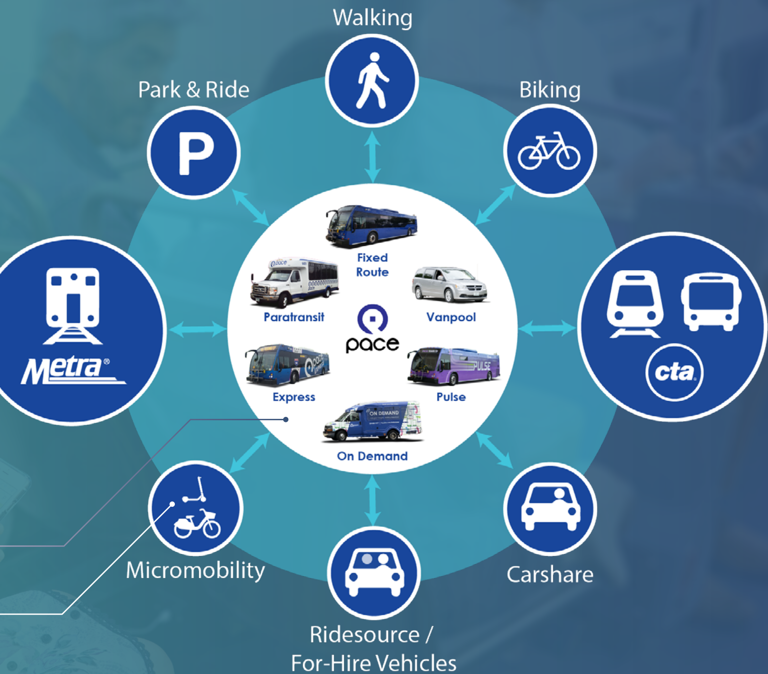
Figure 3: Conceptual relationship of Pace-administered services and partnerships with other mobility providers and modes of travel, based largely on TriMet model diagram of the Mobility on Demand trip planner application ( trimet.org/mod ).