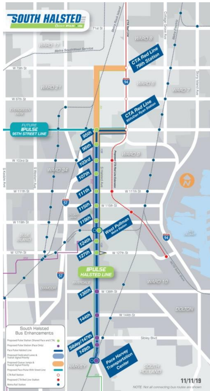
Figure 1-1 South Halsted Project Corridor Map