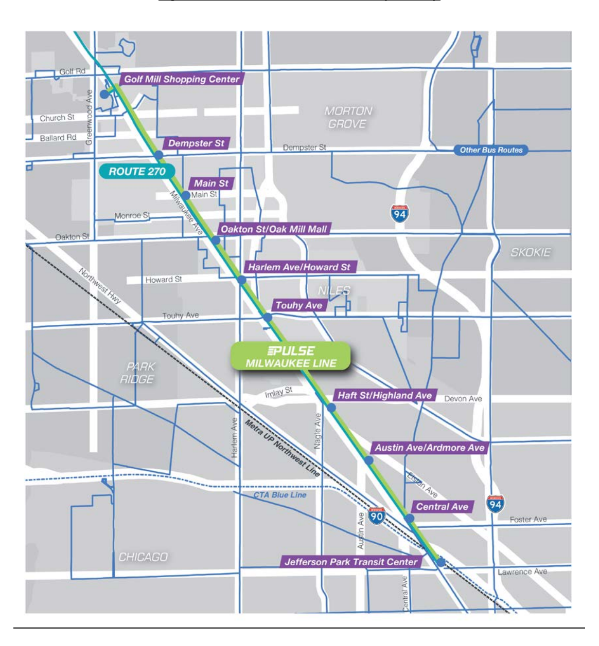
Figure 1-1 Pulse Milwaukee Line Project Map