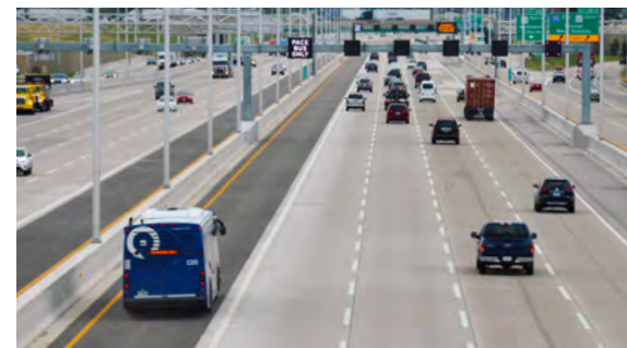
An I-90 Express Bus uses the Flex Lane while driving through Schaumburg.