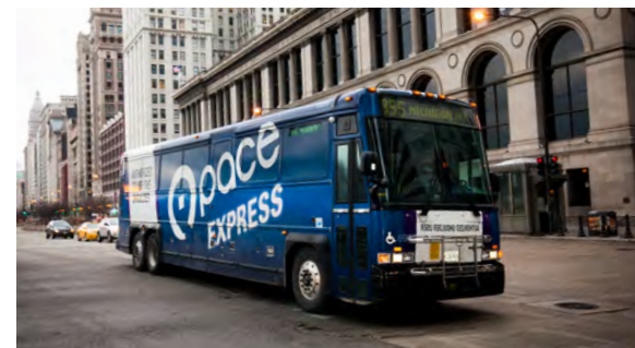
An I-55 Express Bus travels down Michigan Ave. in Downtown Chicago.