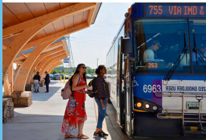
Riders board Route 755, which serves UIC and the Illinois Medical District, at the Pace Park-n-Ride Plainfield.