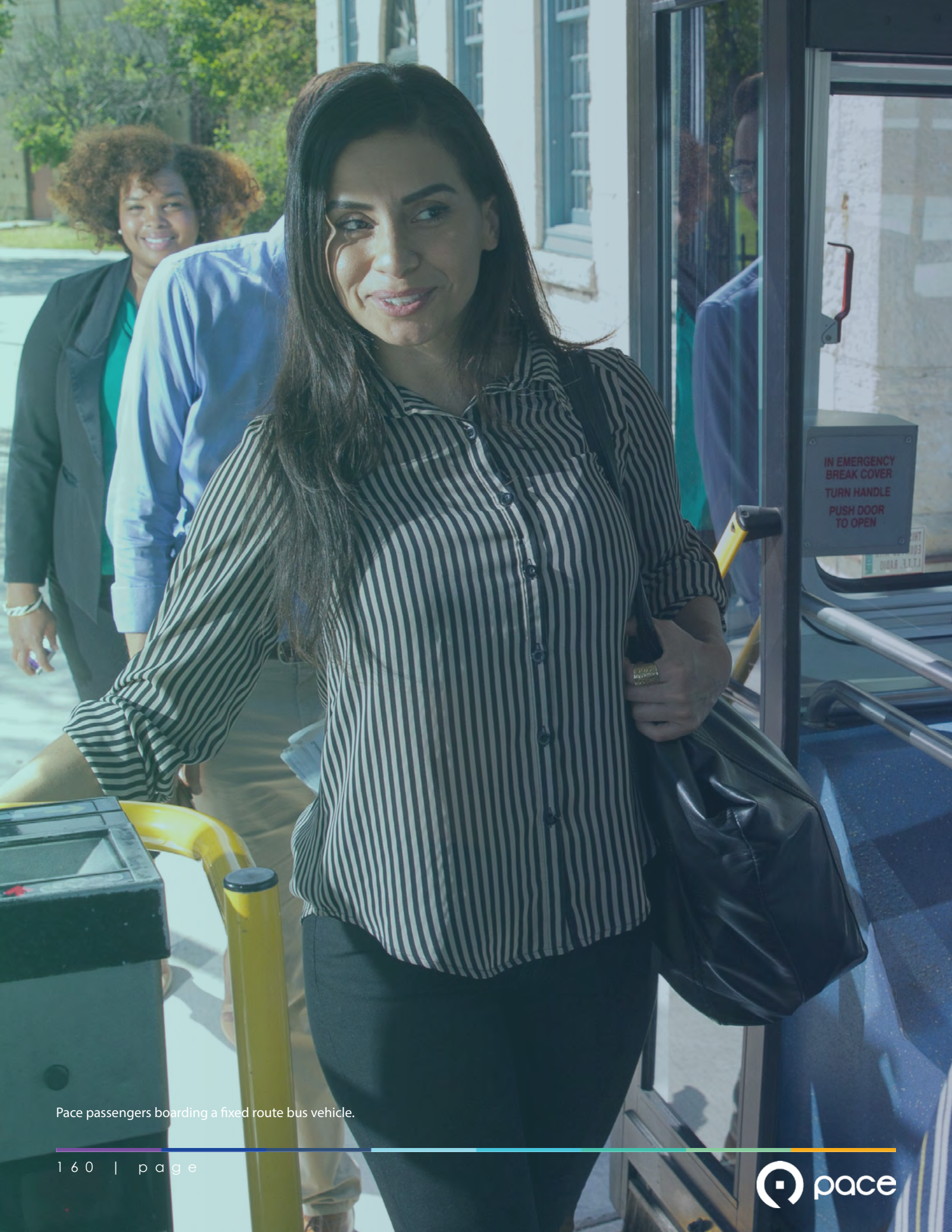
Pace passengers boarding a fixed route bus vehicle.