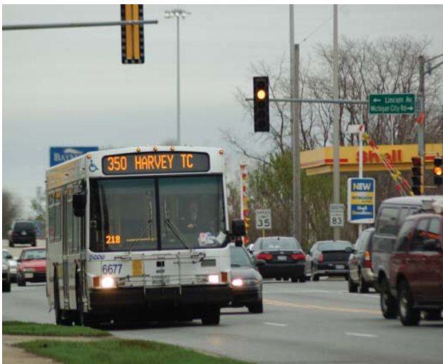
Congestion on arterial roads continues to be a problem for Pace.

*Ridership includes companions and personal care attendants.