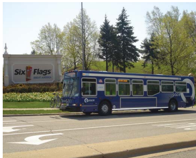
Service to special events continues to show ridership growth.