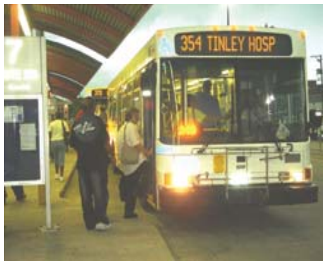
Pace's Harvey Transportation Center is the most heavily used facility in our system.