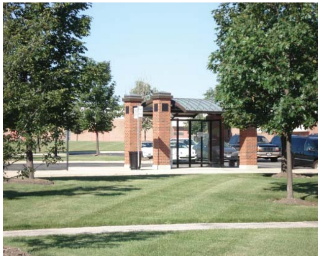
Pace's park-n-ride in Burr Ridge offers an excellent alternative to driving.

Tables 38 and 39 on the following pages identify the current fare structure for Pace Suburban Service—fixed route, dial-a-ride and vanpool.