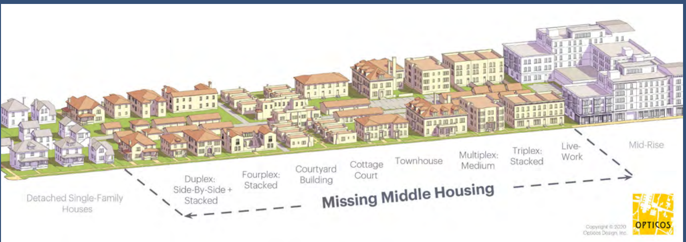
This particular blend of housing, land use, and urban form is relevant to the vast majority of Pace's service area.