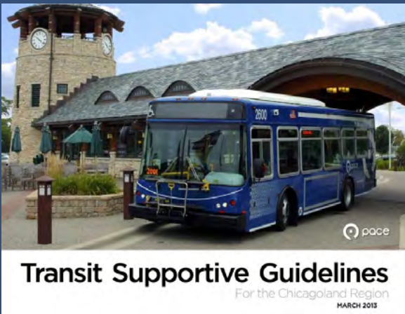
Left: Pace's Transit Supportive Guidelines, completed in 2013, has provided municipalities, roadway agencies and developers with the tools to promote better bus infrastructure and design and strategies for making such complementary with planned developments.