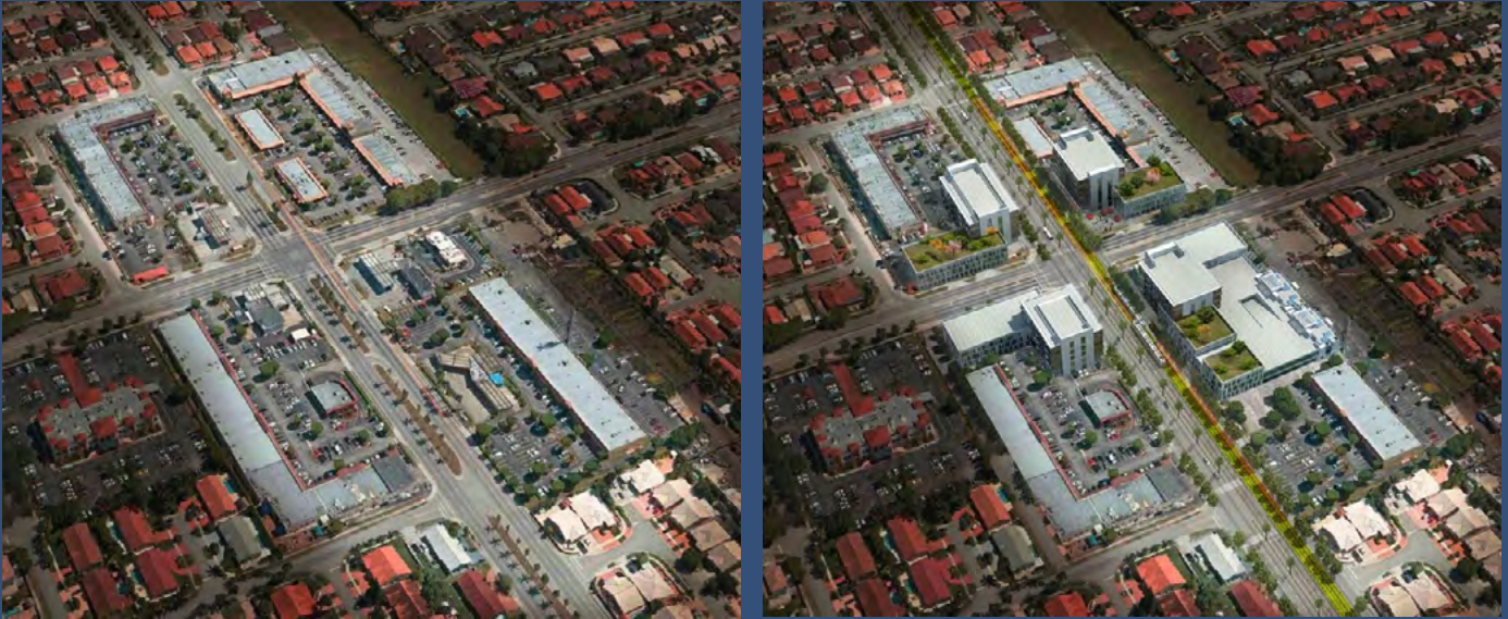
Above: Two land-use approaches are depicted above. The left photo shows a typical suburban development pattern, while the right photo illustrates how infill development in the same area can be achieved and provide an environment more conducive to transit. (plusurbia.com)